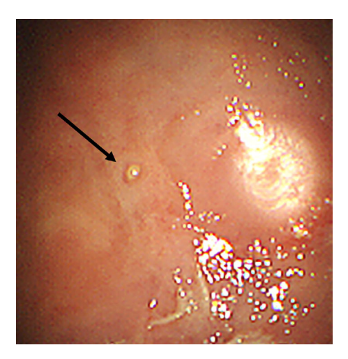
Figure 2. Thoracoscopic finding of the pleura. Several nodules were observed (arrow).