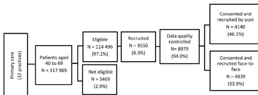
Figure 2. Recruitment via primary care.