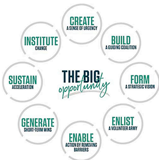
Fig. 1. Kotter's 8-Step Process for Leading Change. Note: Kotter (2020). 8-Steps to accelerate change. [eBook edition]. Publisher. www.kotterinc.com. Permission to reprint granted 8.27.2021.