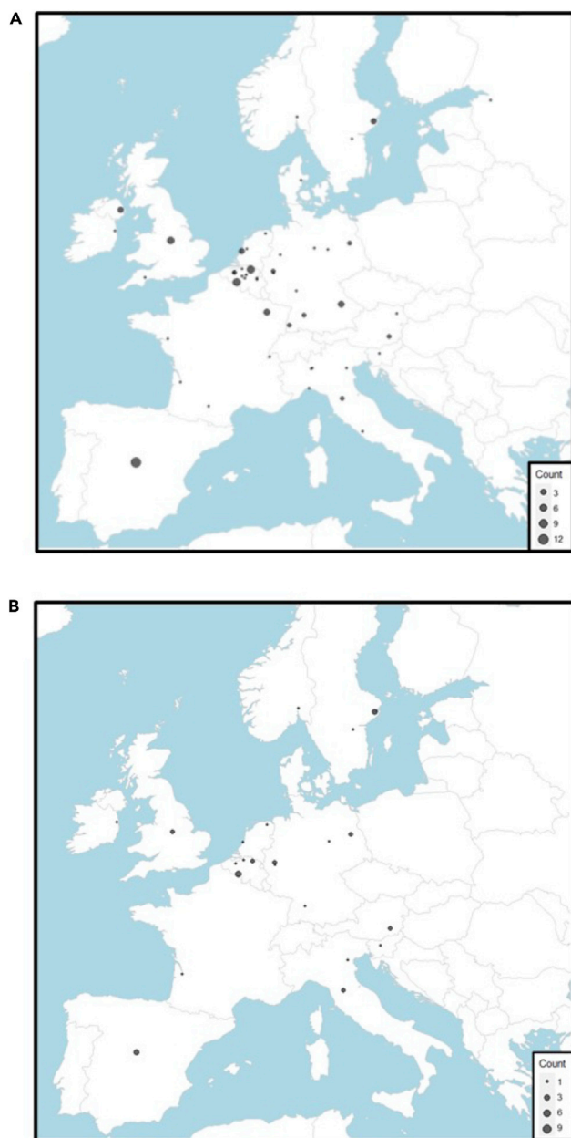
Figure 2. A map highlighting the European site of omics publications up until the first semester of 2020 (A and B) (A) and a map highlighting the site of omics publications co-funded by ESA between 2016 and the first semester of 2020 (B).

Belgium and Germany are the leading countries for space omics publications up until the first semester of 2020, with 24 and 17 publications each, respectively, followed by Spain (12), the UK (9), France (7), and Italy (7) (Figure 2A and Table S12). Regarding funding, Belgium, Germany, and Spain have the highest number of works (co)funded by ESA, with 23, 13, and 7 publications, respectively (Table S10). This shows that from the top five space omics- contributing countries in Europe, Belgian and German investigations are mainly supported by ESA, while Spanish studies are supported by both ESA-dependent and independent funding schemes. However, UK and French research was carried out with little ESA (co)funding. It is unclear whether this is the result of ESA policy, or whether it reflects research funded exclusively from national sources (which are not considered as ESA (co)funded), or if the project/s are funded by a completely different source.