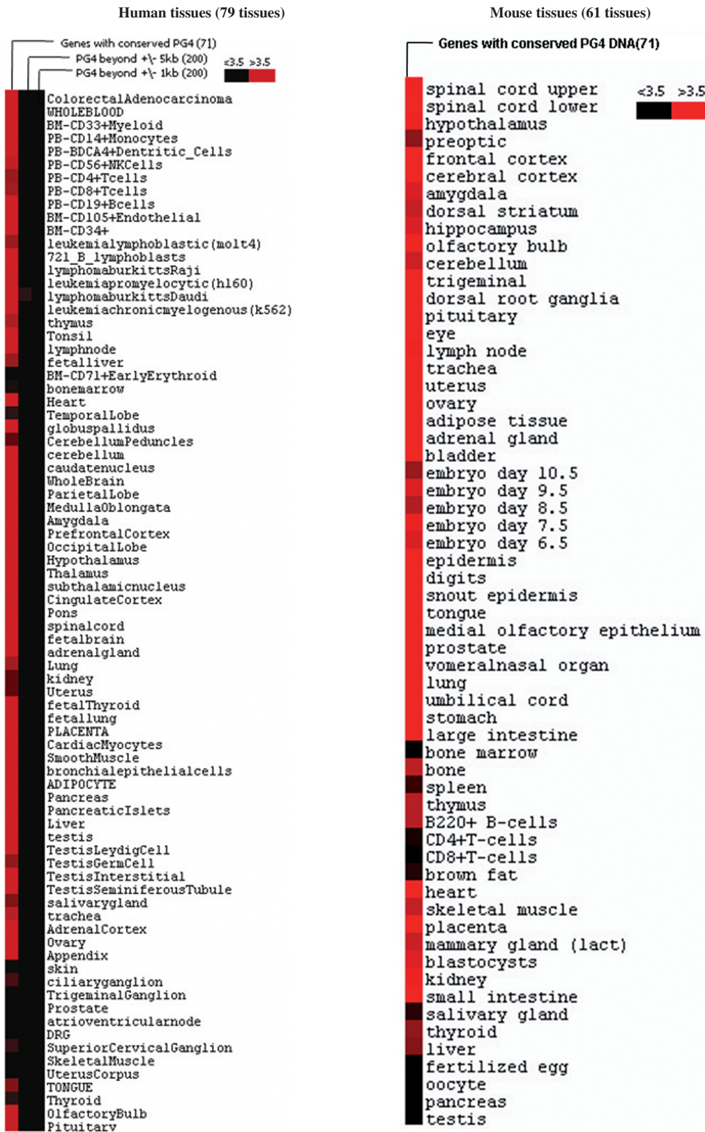
Figure 3. Tissue-specific expression of genes with conserved PG4 DNA in promoters. 71 genes show enriched expression (either up- or down-regulated) in 72/79 human and 56/61 mouse (normal) tissues. Statistical tissue-specific expression enrichment ( z -score > 3.5 , P < 0.0001 ) is represented in pseudo-color for both human and mouse tissues. Genes (200) without PG4 DNA in \pm 1 kb or \pm 5 kb (centered at TSS) do not show enrichment of expression in 79 human tissues (Figure 1).