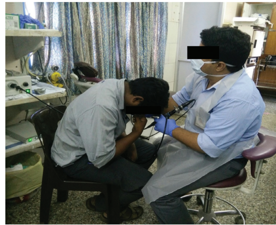
Fig. 1 Flexible laryngoscopy using modified Killian’s method in the outpatient department.

Conventional laryngoscopy was performed in sitting position and subject asked to phonate and larynx visualized. The subject was then asked to bend forwards while in the sitting position with the fiberoptic laryngoscope in position. They were then asked to perform a Valsalva maneuver (→Fig. 1). The pyriform sinuses were then evaluated by turning