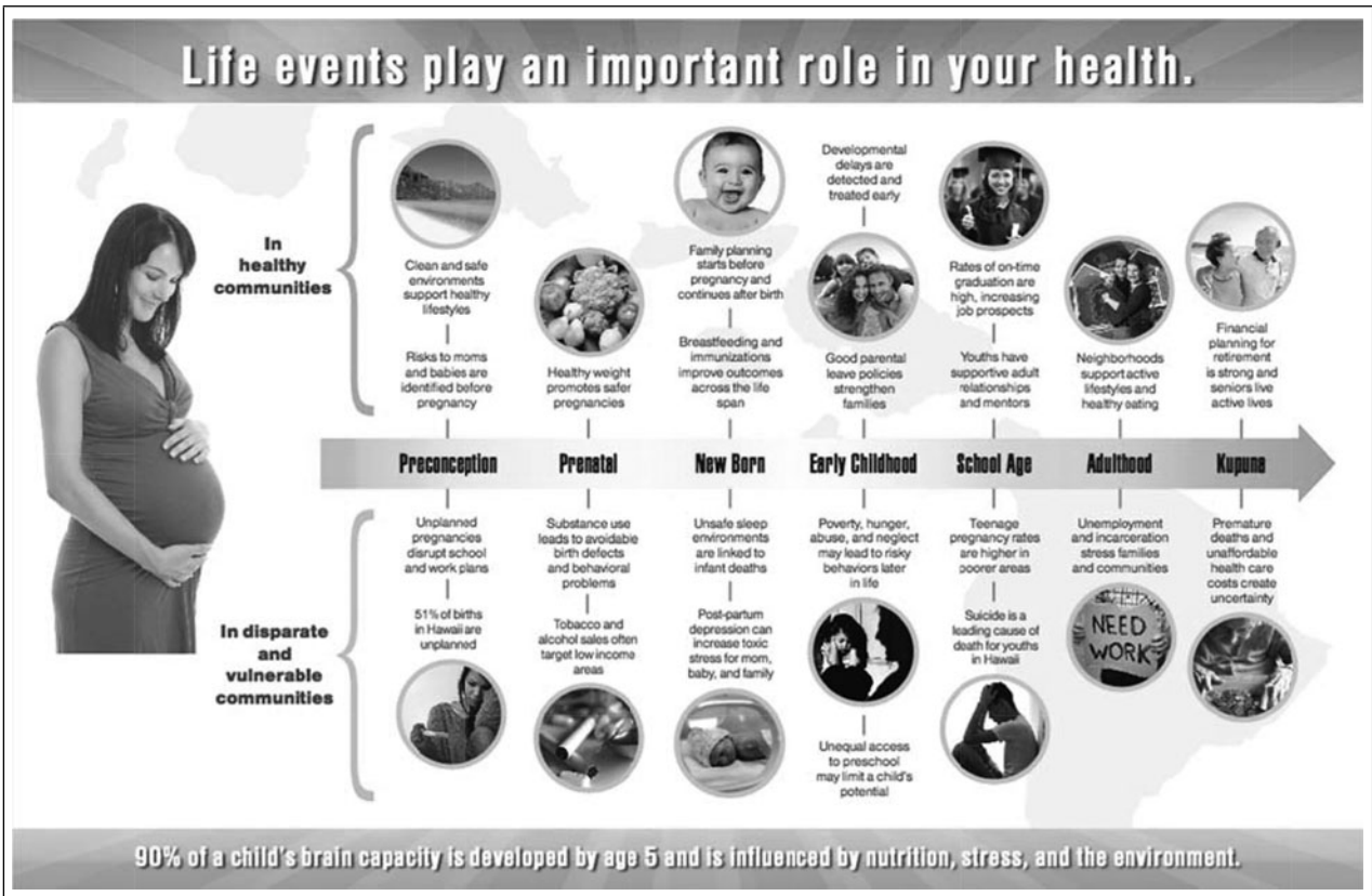
FIGURE 1 Example: Strategic Move 2, Programs to Populations a a From Hawai'i Department of Health. 24 Used with permission.

Moving from programs to populations will take more than just changing the way SHAs are funded, however. The public health workforce must be trained and incented to build systems that address the needs of populations versus continued reinforcement of the pervasive stovepipe approach. The National Consortium for Public Health Workforce Development prioritized the need for public health workforce development efforts to “build systems, not silos.” 27 Despite this need, many contemporary public health workforce development efforts remain mired in traditional, disjointed training solutions heavily loaded toward discipline-based content versus systems and population thinking. These approaches can reinforce silos and prevent crosscutting connections to other activities within the same agency or with other units of state government that might lead to synergies. One only needs to look at the variety of leadership trainings for the public health workforce to see that every major program area has its own academy, institute, or professional development experience, most of which are funded by programmatic categories with little interest in building the system as a whole. Exceptions that lead the way for collaborative, coordinated, and