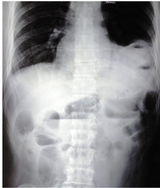
Fig. 1. Posteroanterior chest radiography, there are elevated left lung and a gas-filled intestinal loop on the left cardiophrenic angle and abdomen revealed air-fluid levels due to intestinal obstruction.