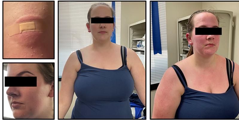
FIGURE 1. Prior patient reactions and cholinergic urticaria exercise provocation test. Left Upper: Large local hive after influenza vaccine. Left Lower: Prior cholinergic urticaria around the cheeks triggered by heat. Middle: Baseline skin before cholinergic urticaria exercise provocation test. Right: Urticaria in face and arms after exercise provocation challenge.

negative chronic urticaria (CU) index (4.3), and IgE levels (74.98 IU/mL) within the reference range. Dermatographism was not present. Skin examination revealed no skin findings of cutaneous mastocytosis. Serum tryptase was 4.7 \mu\text{g/L} and 5.4 \mu\text{g/L} checked 7 and 26 days, respectively, after the event and was within reference range; tryptase was not checked before or during the event. The tryptase alpha/beta 1 (TPSAB1) copy number variation test did not reveal tandem duplication(s) of TPSAB1 by allele-specific PCR. Prick-puncture skin testing for polyethylene glycol, Prevnar 23 (Kenilworth, NJ, Merck), and Pfizer-BioNTech Covid-19 (New York, NY, Pfizer) was negative (Fig. 2). 6 She scored 11 of 21 on the cholinergic urticaria disease severity standardized scale (Investigator Global Assessment), suggesting moderate level of the disease. 7 We further confirmed cholinergic urticaria (Fig. 1) via exercise provocation challenge guided by a standardized protocol. 7