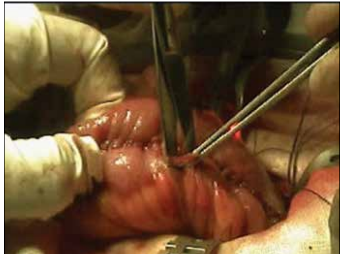
Figure 7. Artificial bladder neck.

During the second stage of operation the tools for GMIA were used including circle-retractor with a set of spatula – expanders optimizing minimum incision access. One of spatulas was equipped with a light guide for illumination of the surgical space. To provide additional lightning a laparoscope was also used in single port. To perform an operation with minimum invasion a set of surgical instruments with a curve were used not to block the view of the surgical space for the surgeon. An inferomedian mini-laparotomy was performed with the length of incision of 4–5 cm and retractor was installed (Figure 4). The instruments for the minimum invasion were allocated, after which the bladder, prostate gland with spermatocyst were removed from abdominal cavity. The single port was used to input a loop of terminal section of ileum 40–50 cm long taken at