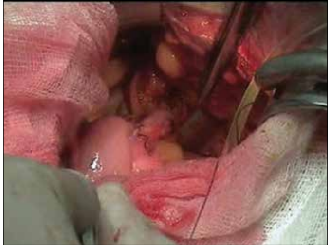
Figure 6. The ureteral-intestinal anastomoses.