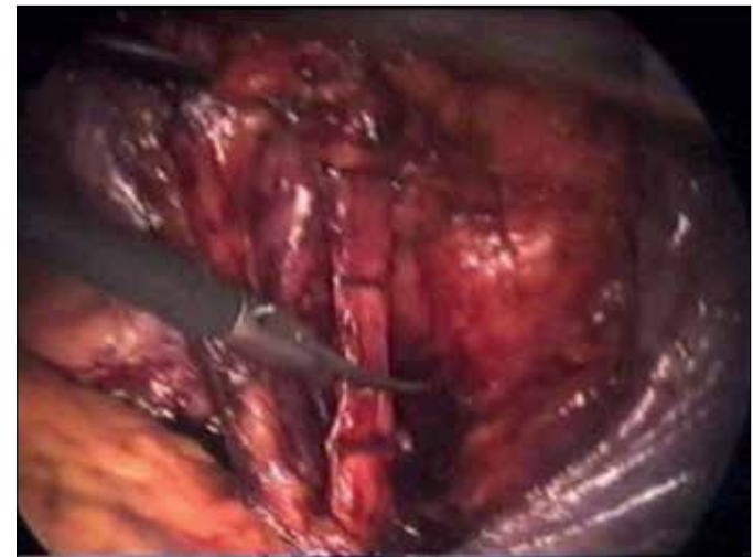
Figure 3. Bladder artery clipped with titanium clips.

The operation was performed under general anesthesia with controlled respiration and prolonged epidural anesthesia. To perform laparoscopic radical cystectomy 5 trocars were used (3–10 mm and 2–5 mm) (Figure 1). After installation of trocars and creating carboxyperitoneum, taking into account the disease state a limited pelvic lymph node dissection proximally to the bifurcation of the common iliac vessels was performed. Further the lower segments of ureter were detected below the point of intersection with