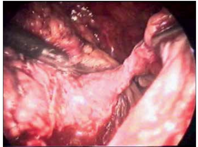
Figure 2. Prevesical segment of the ureter was mobilized.

cal cystectomy and Studer's ortotopic bladder substitution (Group 2), mean age was 56.7 (41–76) years. All patients were male, without signs of obesity.