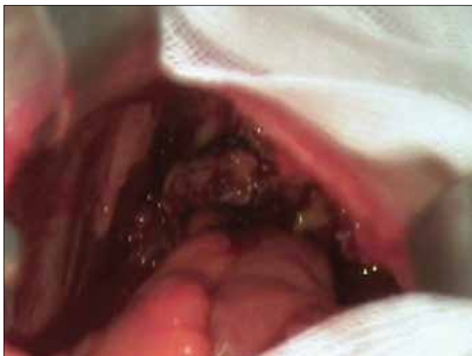
Figure 8. Intestinal–urethral anastomosis.

catheter No 20–22 meant for neobladder drainage were installed through urethra (Figure 8).