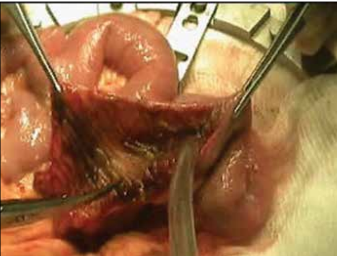
Figure 5. Extracorporeal formation of neobladder.