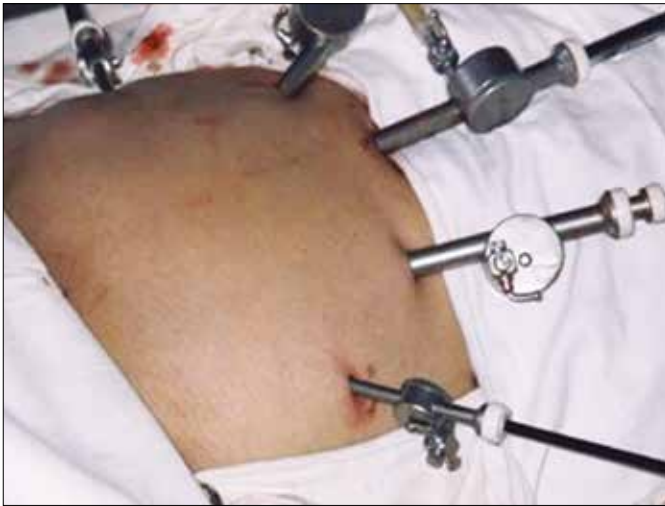
Figure 1. Installation of the trocars.