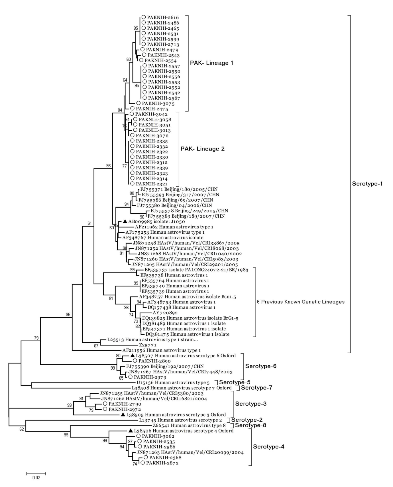
Figure 2. Phylogenetic analysis of Human Astrovirus strains identified in this study based on the partial ORF2 region (348 bases) encoding outer capsid precursor protein. The reference strains and closest match isolates detected through BLAST are given for genetic comparison. The phylogenetic tree with 500 bootstrap replicates was reconstructed using neighbor joining method and the K-2P model through MEGA 4.0. Serotype-1 strains were compared to four prototype strains (USA-GenBank accession number L23513, isolated in 1994), United Kingdom (GenBank accession number Z25771, isolated in 1990), Japan (GenBank accession number AB009985, isolated in 1997) and Germany (GenBank accession number AY720892). Taxa with arrow head indicates prototype strains within each serotype. doi:10.1371/journal.pone.0061667.g002