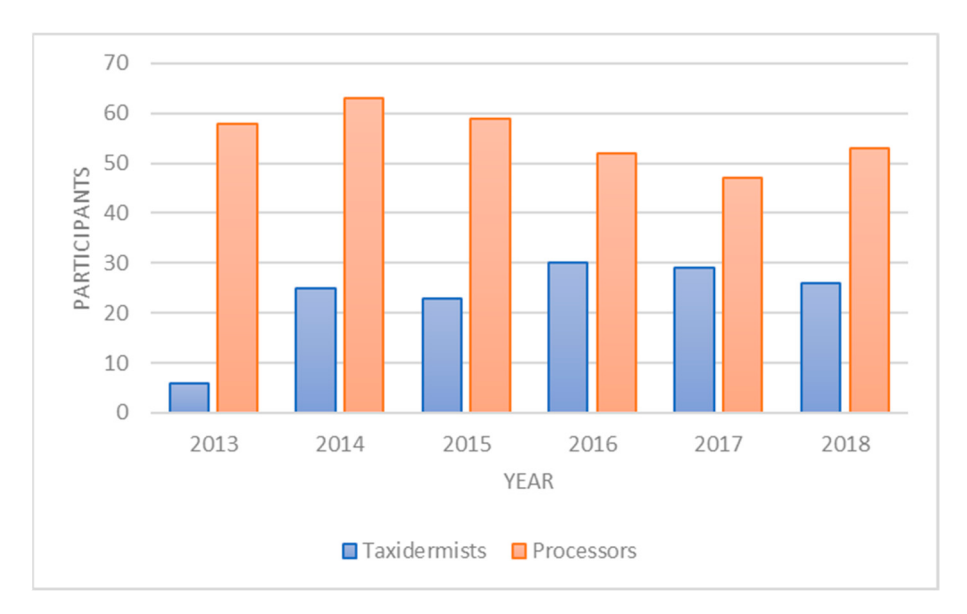
Figure 1. Taxidermist and processors providing deer heads or collecting retropharyngeal lymph node (RPLN) samples for Chronic Wasting Disease (CWD) testing in New York State since 2013.

Despite the large numbers of taxidermists and processors in operation, only 17% of taxidermists and 25% of meat processors participate by providing deer heads or collecting RPLN. However, using the payment structure, we have been able to maintain a consistent number of participating processors and taxidermists (Figure 1).