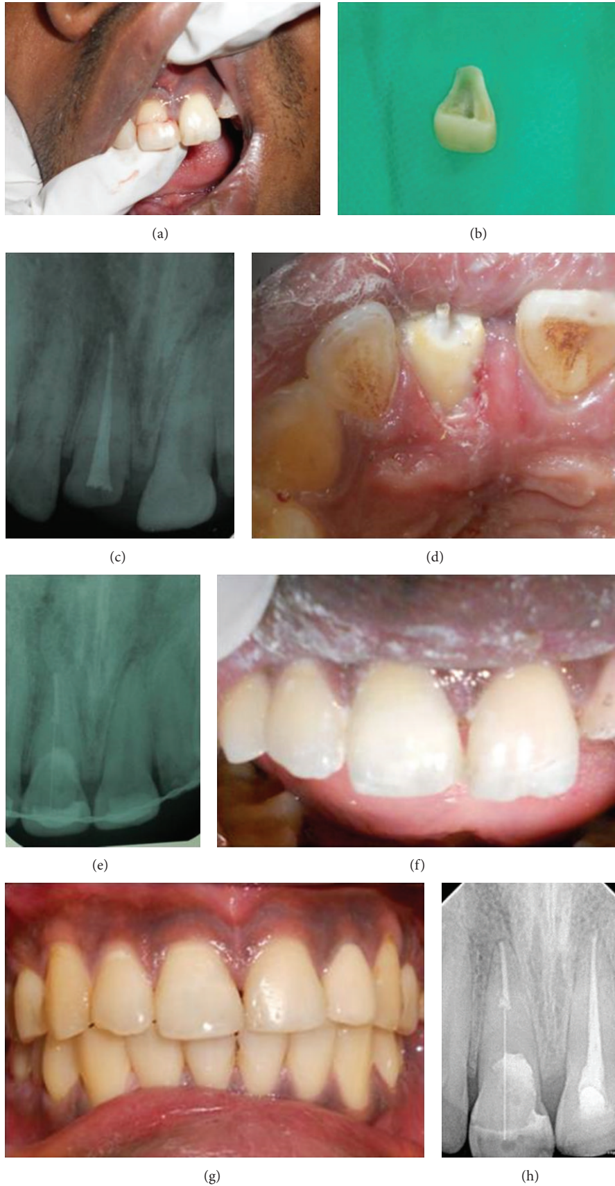
FIGURE 1: (a) Preoperative view. (b) Fractured segment. (c) Postobturation 11. (d) Post luted on 11. (e) Postoperative radiograph. (f) Postoperative view. (g) 1-year follow-up view. (h) 1-year follow-up radiograph.