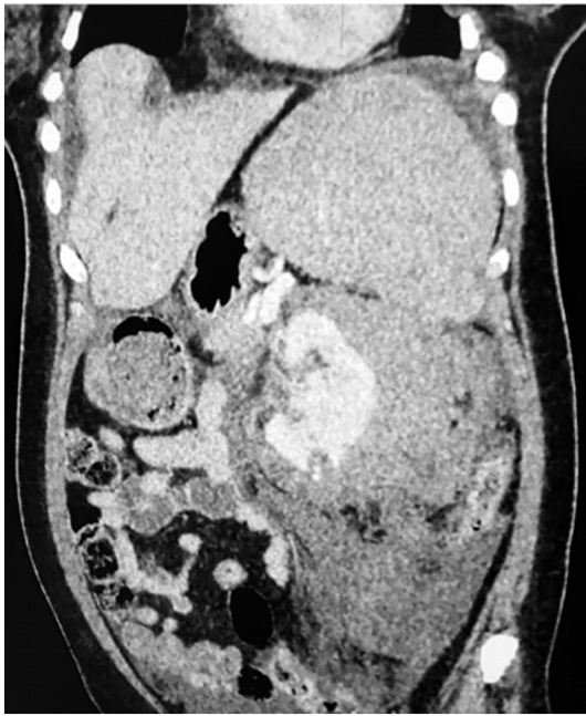
Fig. 1. Contrast computed tomography (CT) (coronal section) shows large left perinephric hematoma with compressed, medially displaced kidney with small renal infarction and contrast leak at biopsy site (marked with a pointer).