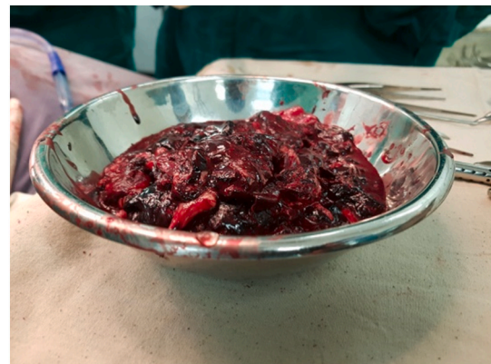
Fig. 3. Evacuated perinephric hematoma around 2 l.

Page kidney or Page phenomenon results from external compression of kidney. The kidney is surrounded by smooth and tough fibrous capsule that has limited space, and fluid under the capsule or under the Gerota's fascia can cause compression of kidney resulting in Page kidney. Gerota's fascia has a larger space and can accommodate considerable amount blood or fluid before kidney parenchyma is compressed rather than sub renal capsular space [5]. Compression of the parenchyma can compromise the intra renal blood flow which activates Renin-Angiotensin-Aldosterone System (RAAS) leading to systemic hypertension. In most cases, Page kidney compression causing hypertension is extra capsular in origin as it was in our patient [6]. Post procedural bleeding following renal biopsy is one of the causes for Page kidney [7]. Age, platelet count, pre-procedure hemoglobin, lower BMI, and smaller kidney size on ultrasound; all contribute to the risk of