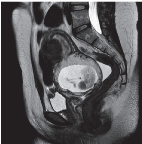
FIGURE 2: T2 weighted pelvic MRI: approximately 6.5 x 4.5 x 5 cm amniotic sac with embryo, centered in the cervix.

[1]. Unfortunately, this leads to a lack of standards of care to approach this event. Depending on the hemodynamic stability of the patient and desires for future fertility, there are different approaches both medical and surgical [2]. Irrespective of the initial management, the greatest risk of cervical ectopic pregnancies remains to be catastrophic and life-threatening hemorrhage.