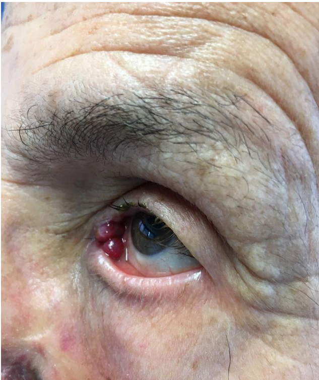
Figure 3: Two adjacent intraorbital nodules, the medial area of the left tear chamber, of a brownish red colour from the diameter of about 5 mm

The operation, performed at the eye clinic (May 2018), and the subsequent histological examination confirmed KS. Currently, the patient practices cycles of liposomal doxorubicin, finding a containment of the manifestations. After six months, there are no other ocular manifestations (Figure 4).