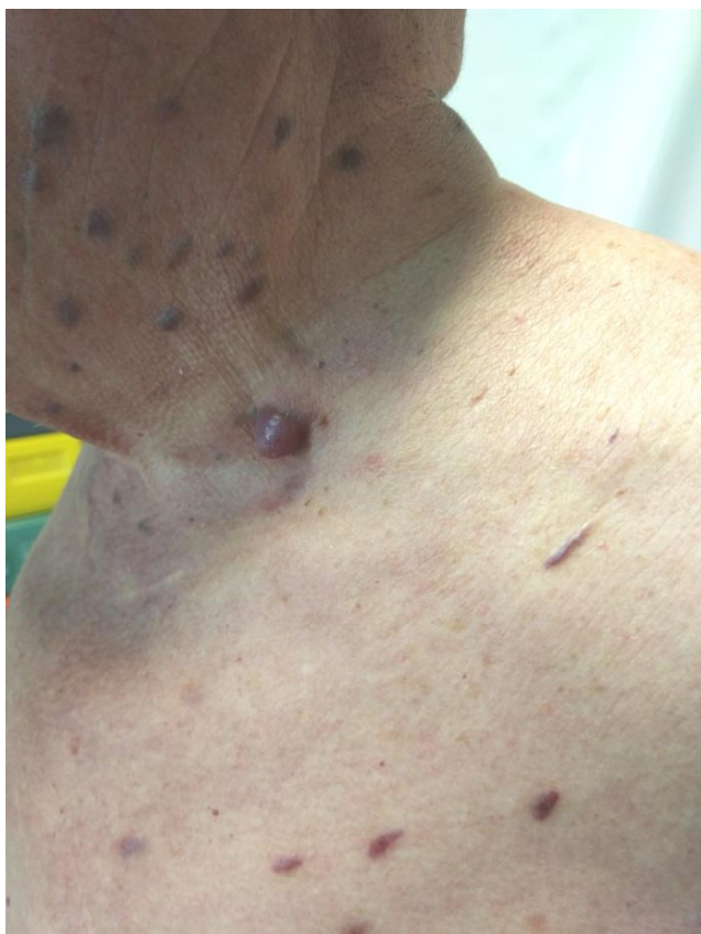
Figure 1: Multiple blue and purplish red nodules varying in size from 1-3 cm affecting the neck

fusiform cells and endothelial cells with extravasation of red blood cells and intervening slit-like spaces. Endothelial cells were positive HHV-8 by immunohistochemistry.