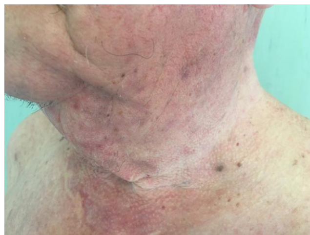
Figure 2: Clinical improvement with reduction/absence of nodules dimension

These findings were consistent with Kaposi Sarcoma diagnosis, nodular stage. Laboratory investigations showed HIV test negativity (antibodies anti HIV1/2-antigen p24), White Blood Cells 10.57 \times 10^3/\mu\text{L} (normal range 4.8-10.8), Red Blood Cells 4.16 \times 10^6/\mu\text{L} (4.2-5.6), Platelets 234 \times 10^3/\mu\text{L} (130-400); Hb 15 g/dL (12-17.5), liver function [ALT 21 U/L (0 – 55); AST 22 U/L (0 – 34)] and renal function [creatinine 0.7 mg/dL (0.7-1.2)] tests within the normal limit. Chest X-ray, abdominal and lymph node ultrasound and low gastrointestinal endoscopy were normal. Faecal occult blood test and video-laryngoscopy were performed, and no abnormalities were documented. Considering widespread skin involvement (> 25 lesions) and oral lesions, he was put on monthly chemotherapy with vinblastine dose of 10 mg. White blood count was normal, and patient-reported only nausea. The clinical examination nine months after starting therapy showed clinical improvement with reduction of nodules dimension (Figure 2). After one year, no recurrence was observed.