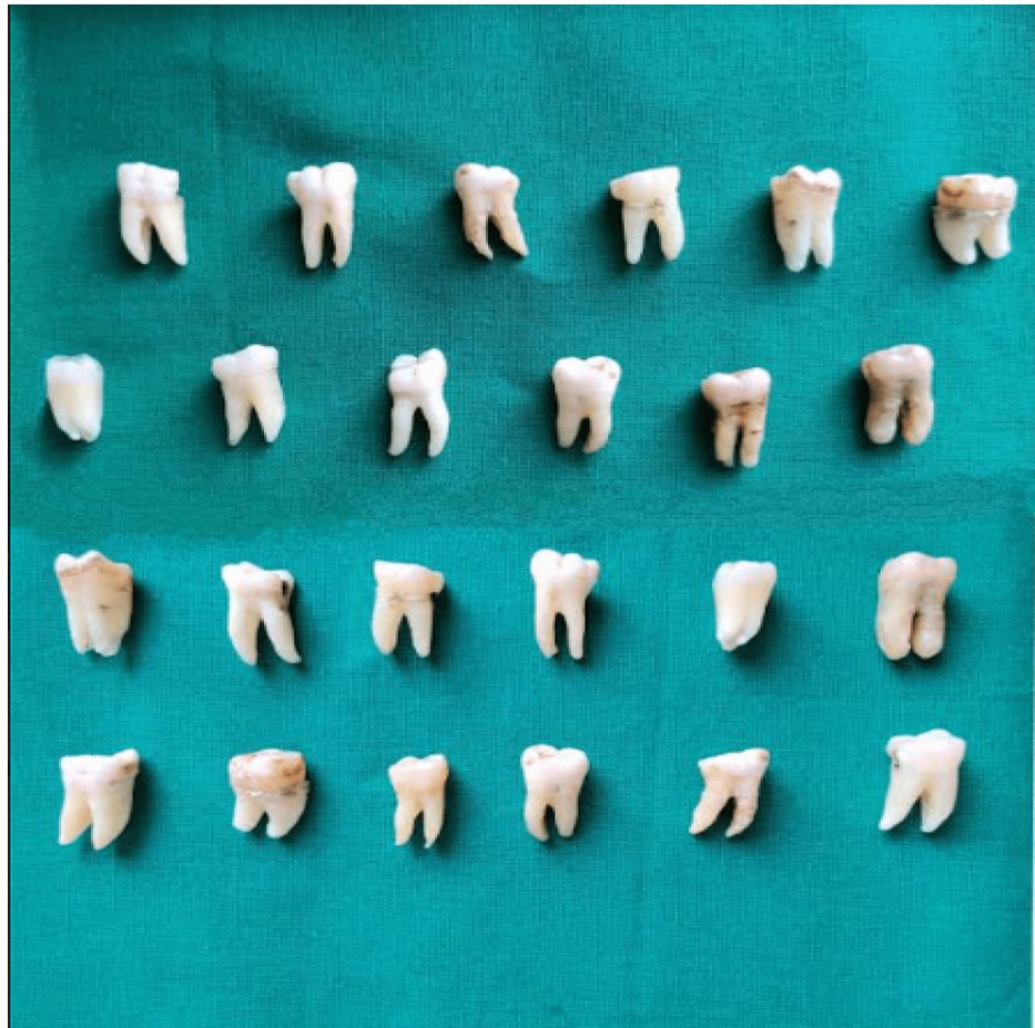
FIGURE 1: Samples were collected and cleaned

The present study was conducted in the Department of Conservative Dentistry and Endodontics at Sharad Pawar Dental College and Hospital. The ethical approval to perform the study was obtained from the Datta Meghe Institute of Medical Sciences Ethical Committee (DMIMS(DU)/IEC/2021/132). Twenty-four freshly extracted molars were taken (Figure 1). The teeth that were caries free and unrestored were chosen for the study. The teeth with restorations, cracks, enamel and dentin fractures were excluded from the study. The teeth were cleaned with the help of scaler tips to clear all tissue tags and debris and then stored in 0.9% normal saline.