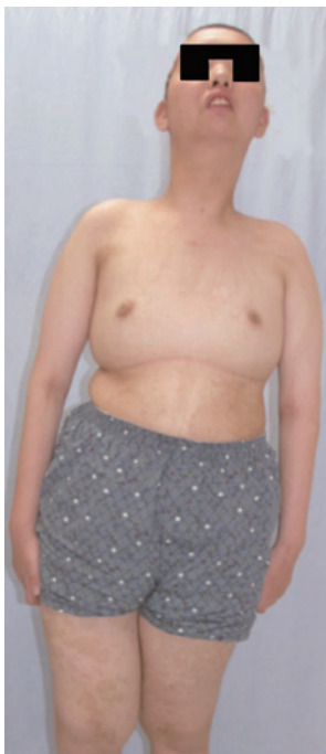
Fig. 1 Photographs of the patient. In addition to obesity of the trunk, thin limbs, and microcephalia, characteristic features of Cohen syndrome were observed, such as marked prominence of the nose root, wide nose wing, short philtrum, extorsion of thick lips, and large incisors. The coronal balance of the trunk was inclined.

On preoperative plain radiograph, scoliosis of T5-T11 was 47^{\circ} , that of T11-L3 was 79^{\circ} , L3 tilt was 34^{\circ} , and kyphosis of T7-L1 was 86^{\circ} (Fig. 2A,B). In the lateral bending film, both the