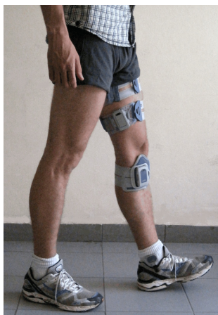
Figure 1 The Ness L300Plus system.

Gait velocity was assessed at baseline and after 6 weeks of conditioning by a qualified physical therapist as follows: immediately after fitting the dual-channel FES system and adjusting the electrode placement and stimulation parameters, each patient underwent gait evaluations with and without FES. This initial assessment (T1) was followed by a 6-week adaptation period during which participants increased their daily use of the system according to a fixed protocol, so that by the end of the fourth week, all subjects were able to use