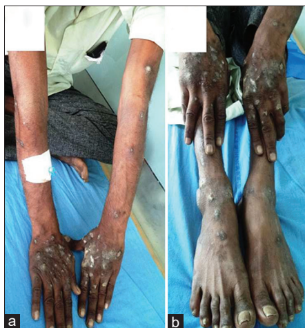
Figure 1: Hyperpigmented papulonodular lesions with few plaques with crust and hypopigmentation at places over the extensor aspect of arms, dorsa of hands (a), similar lesions over the dorsa of both feet (b)