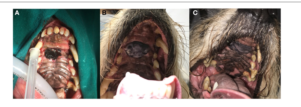
FIGURE 2 | Clinical images of patient no. 8 with an incompletely excised oral melanoma of the hard palate before treatment (A), 270 days (B), and 529 days (C) after treatment initiation. Stable disease (SD) was observed. The dog has not experienced any systemic side effects to treatment and was still alive at the time of writing of this report.