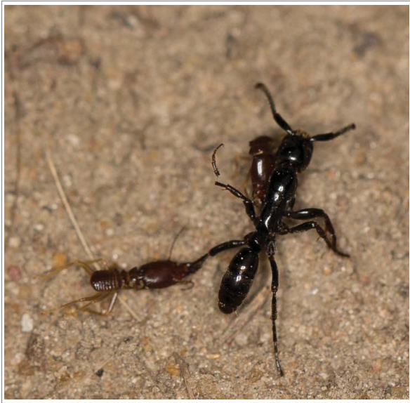
Figure 1. Megaponera analis minor with 2 clinging termite soldiers. Notice the loss of the tarsus on the mid leg.

Seychelles warblers ( Acrocephalus sechellensis ) free group members from sticky seeds on their wings, which without help can be deadly for the entangled bird 11 and dolphins help injured individuals stay afloat so they can breathe. 12