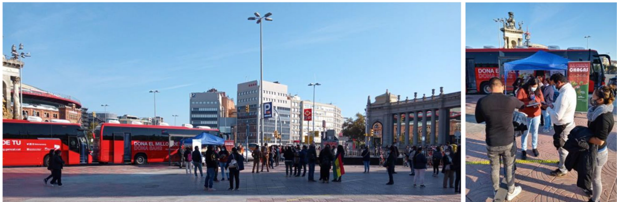
Fig. 1 Left: General view of the field study place, with two mobile units and a stand. Right: Community health workers and members of the association of people affected by Chagas disease (ASAPECHA) offering information and infection screening to people that came to vote.

metropolitan area of Barcelona. All Bolivian nationals were eligible to participate in the screening.