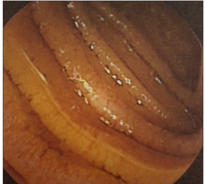
Figure 2. Capsule endoscopy showing small intestinal scalloping.

RCD is a rare occurrence in pediatrics, and to our knowledge, only 1 case has been reported. 4 The most reliable method to screen for compliance with GFD is detailed nutritional evaluation, and it is imperative to confirm strict GFD compliance for at least 12 months before considering RCD. The presence of celiac antibodies does not necessarily exclude the diagnosis of RCD, as 19–30% of patients with RCD continue to have positive celiac serology. 5 Not