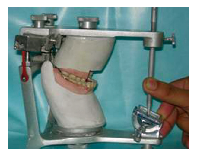
Figure 10: Establishment of balanced articulation