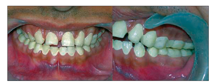
Figure 5: Stage I temporaries

esthetics. The chairside disadvantages include<sup>[1]</sup> arduous, unpredictable patient visits,<sup>[2]</sup> full arch anesthesia,<sup>[3]</sup> full arch chairside treatment restorations,<sup>[4]</sup> multiple occlusal records, and <sup>[5,6]</sup>possible loss of the vertical dimension of occlusion. Miscellaneous disadvantages are (1) the need for accurate cross-arch multiple tooth impressions and/or (2) the need for transfer techniques to fabricate full arch