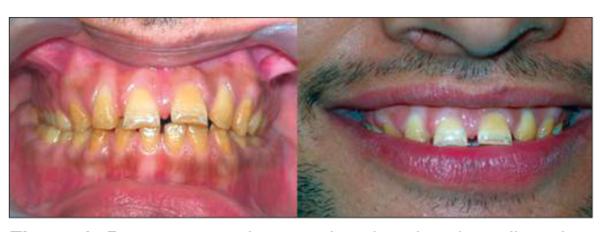
Figure 1: Pre-op views showing discolored and small teeth

Intraoral: There was generalized discoloration of the upper and lower dentition with fair oral hygiene. The mandibular arch was fully dentate and the maxillary arch was having missing 18 and 28. No gross abnormalities were noted in the overall soft tissues of the lips, cheeks, tongue, oral mucosa, and pharynx. A generalized pitting defect was noted. Open contact was present in relation to upper and lower anterior teeth with a midline diastema.