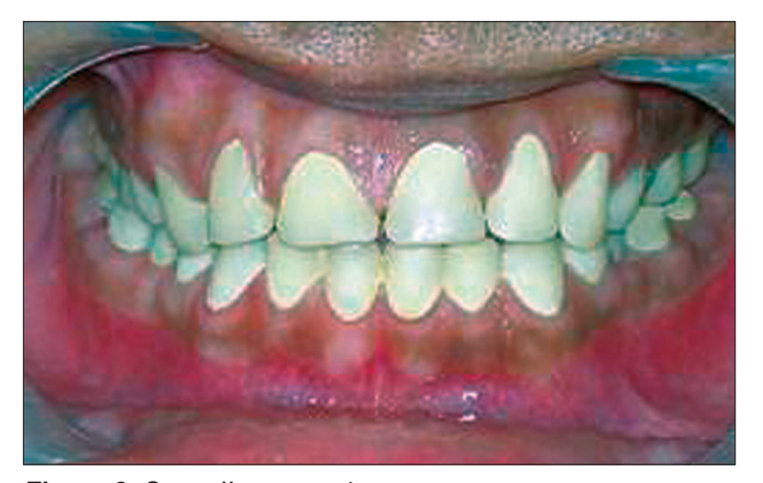
Figure 6: Stage II temporaries