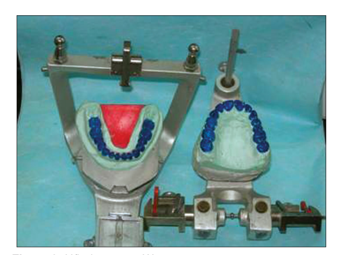
Figure 3: U/L diagnostic Wax-up