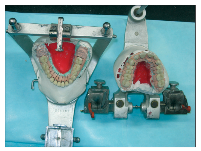
Figure 8: PFM crowns