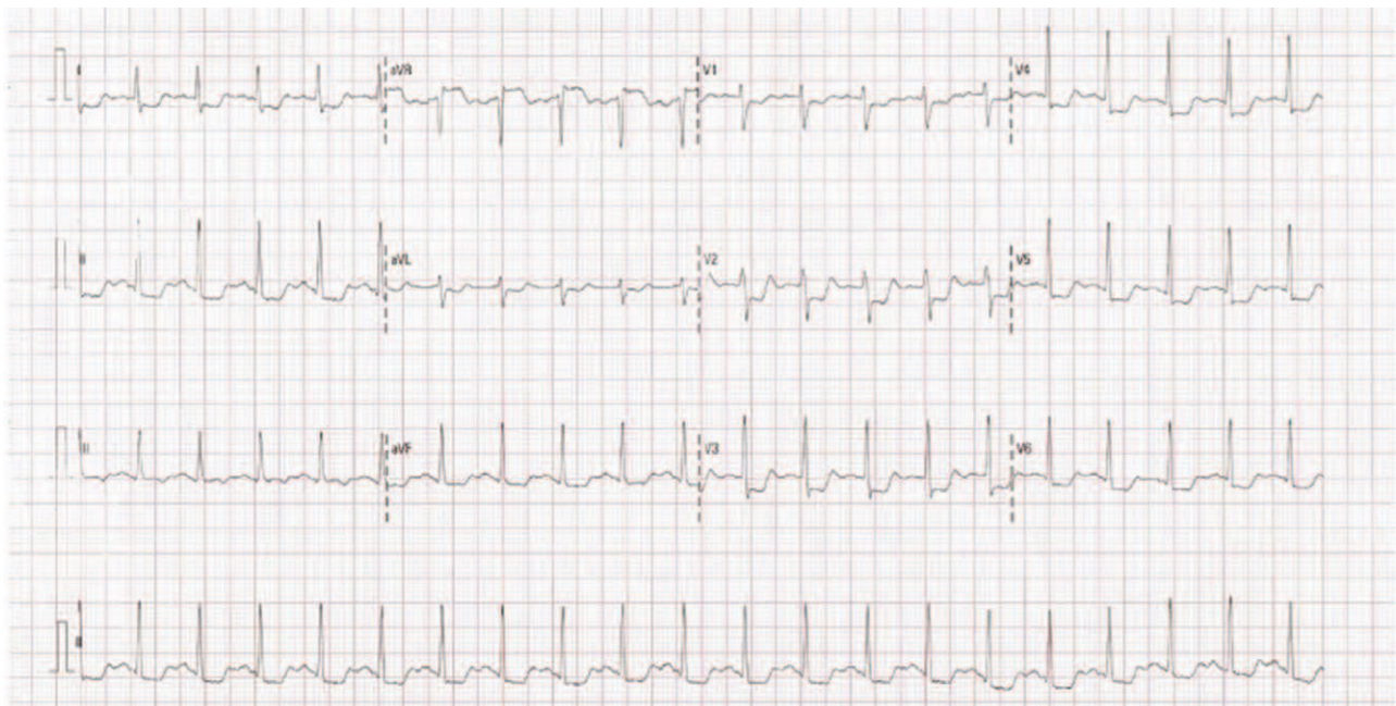
Figure 1. Electrocardiogram in the emergency room shows ST-segment elevation in the aVR lead and ST-segment depression in the V1-V6 leads, indicating left main coronary artery disease.

Radiotherapy-induced pathological changes in the coronary arteries are different from those in typical atherosclerosis. First, the radiotherapy-induced lesion usually does not cause systemic inflammation proven by irradiated animal models, and out-of-field arteries were unaffected. [5] Second, histologically, the lesions in the exposed artery are diffuse with prominent fibrosis proven by autopsy. [4] Even in the high-fat diet hyperlipidemic apolipoprotein E knockout mice model, prominent fibrosis with a smaller lipid core was observed. [6] This was consistent with the IVUS findings in our case and the literature. [7,8] Atherosclerotic lesions, especially advanced lesions, are characterized by a