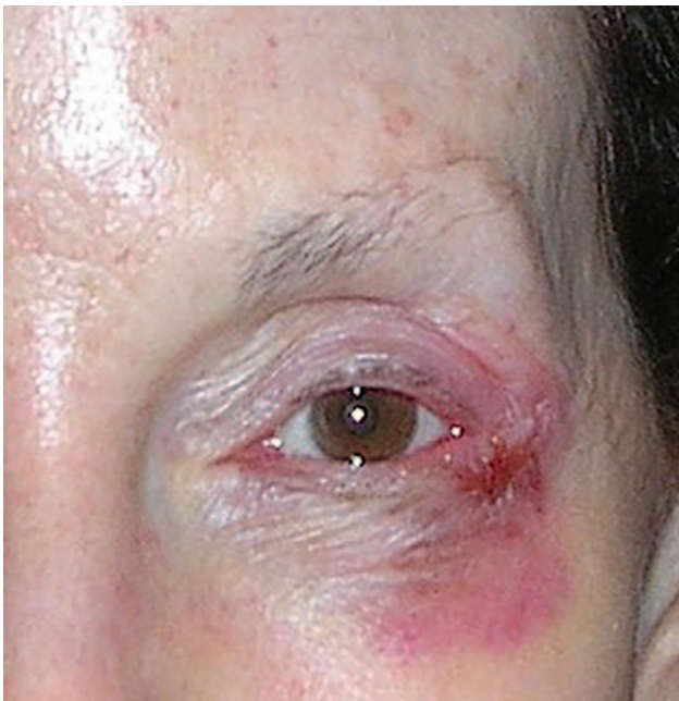
Fig. 3. A closer detail of the patient's left eyelid 3 weeks after the commencement of Imiquimod treatment resulting in profound inflammation of lower eyelid extending beyond original.

formed in the area of darkest pigmentation (lateral lower eyelid) and a slight ectropion seemed (Fig. 1). Treatment extended for another 3 weeks and was then discontinued. As healing continued, normal skin appeared. Two months later, an excisional biopsy taken from the same site as the first biopsy in the most lateral extent of the eyelid showed no tumor present (Fig. 1). Six weeks later, the eyelid seemed entirely normal with pigmentation matching the contralateral side, no ectropion, no ulceration, and no erythema (Fig. 1).