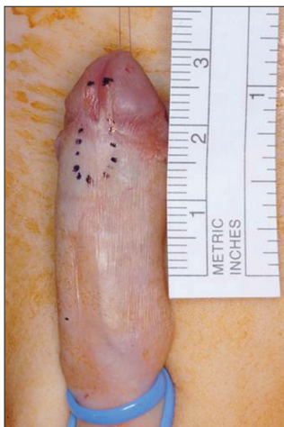
Figure 1: Marking of Mathieu's flap showing lips of un-formed meatus, points of glans closure and glans wings at neo-meatus level

A Foley catheter was inserted for urinary diversion. Trilaminare Allevyn (Smith and Nephew, UK and Ireland) non-adherent dressing was used [9] due to the ease of application and removal. This replaced the conformable foam (Cavi-care, Smith and Nephew, UK and Ireland) dressing used in early cases. The catheter and dressing were removed after 48 h postoperatively. [10] Parents were given the choice of the child staying only the first night and returning for removal of dressing and catheter or the full 48 h. [11]