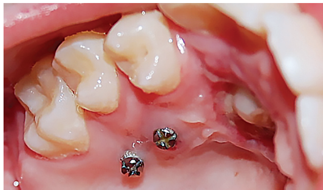
Figure 2 - Miniscrews were inserted mesial and distal to the maxillary second premolar.