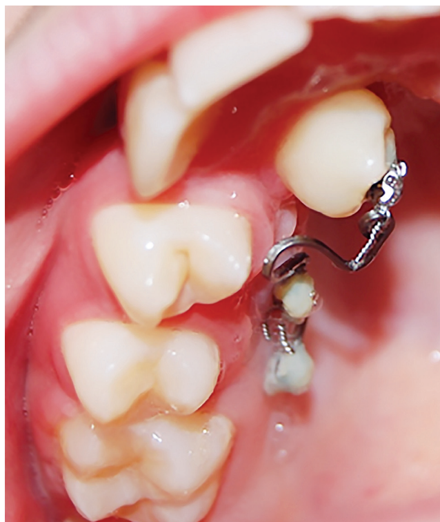
Figure 3 - Four months after initiation of force application.