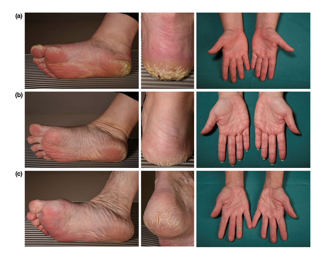
Figure 2 Dermatological findings in patients with DSP c.2493delA p.(Glu831Aspfs*33) mutation.Variable focal hyperkeratosis of the heels, toes and soles and palmar hyperlinearity (from mild to more prominent) in patients with DSP c.2493delA p.(Glu831Aspfs*33) mutation: (a) index IV:12, (b) III:7, and (c) IV:10.

dilated left ventricle in echocardiography (Table 2) without systolic dysfunction. III:1 had chronic heart failure according to medical records but could not be assessed, and the cause of heart failure remained unknown to us. Two patients (III:5, IV:8) had neither dilated left ventricle nor systolic dysfunction. In ECG, 3/ 8 had lateral T-inversions and one had lateral and inferior Tinversions. 4/8 underwent Holter monitoring and all had >100 VES/24 h), three had also episodes of non-sustained ventricular tachycardia (NSVT), and in addition two of them had >100 supraventricular extrasystoles (SVES)/24 h. None had severe ventricular arrhythmias (sustained ventricular tachycardia or ventricular fibrillation). 5/8 reported palpitations, but none reported chest pain or dyspnea. An implantable cardioverterdefibrillator (ICD) was implanted in 2/8.