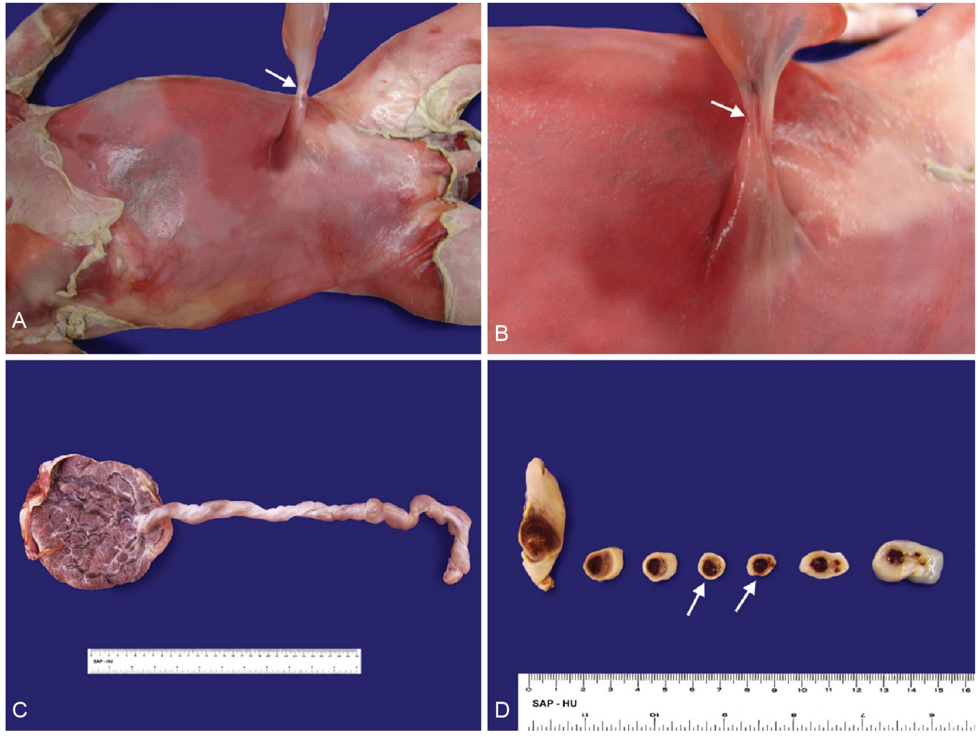
Figure 1 – Gross examination of the stillbirth. A and B – Constriction of the umbilical cord close to its insertion into the fetal surface; \mathbf{C} – External examination of the placenta and the umbilical cord. Note the marginal insertion of the umbilical cord at the placenta; \mathbf{D} – Sequential cuts of the umbilical cord.

The umbilical cord—the fetal lifeline—is a structure that connects the fetus to the placenta, and is crucial for fetal development. It is composed of two arteries and one vein and is cushioned by a special type of mucous connective tissue known as Wharton's jelly. At birth, the average diameter and circumference of the umbilical cord in a normal-term infant is 1.5 cm and 3.6 cm, respectively.<sup>3,4</sup> Wharton's jelly seems to have the function of the adventitia layer, which is lacking in the umbilical cord, and binds and encases the umbilical vessels. Wharton's jelly is an amorphous substance, which is rich in glycosaminoglycans, proteoglycans, and