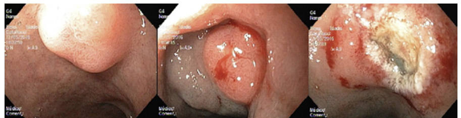
Fig. 2. Endoscopic mucosal resection of a 12-mm subepithelial lesion of the duodenal bulb.

tional upper GI endoscope and a crescent-type snare (EMR snare, Olympus). Hot-snare resection was done after submucosal injection with normal saline and diluted adrenaline (1:10,000 to 1:50,000 dilution) and suction of the lesion into the cap. ESD was performed as previously described (Fig. 3). Briefly, small coagulation marks were made around the lesion and then submucosal injection was performed with saline, diluted epinephrine (1:50-100,000), and methylene blue. After elevation, 3-4 incisions were made with a needle knife (Olympus®) to get access to the submucosal layer, and an insulated-tip knife (mainly IT-Knife™; Olympus®) was used to perform circumferential dissection using the Endo Cut mode