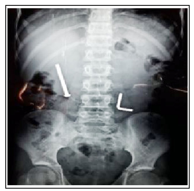
Fig.1a: Ingested nail seen on X Ray erect abdomen.