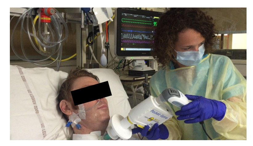
Fig 1. Setup of measurements. Inspiratory muscle training was performed with the portable spirometer placed between the electronic inspiratory training device (Panel A) and connected to the patient either via an endotracheal tube or via a tracheostomy (Panel B).

https://doi.org/10.1371/journal.pone.0255431.g001