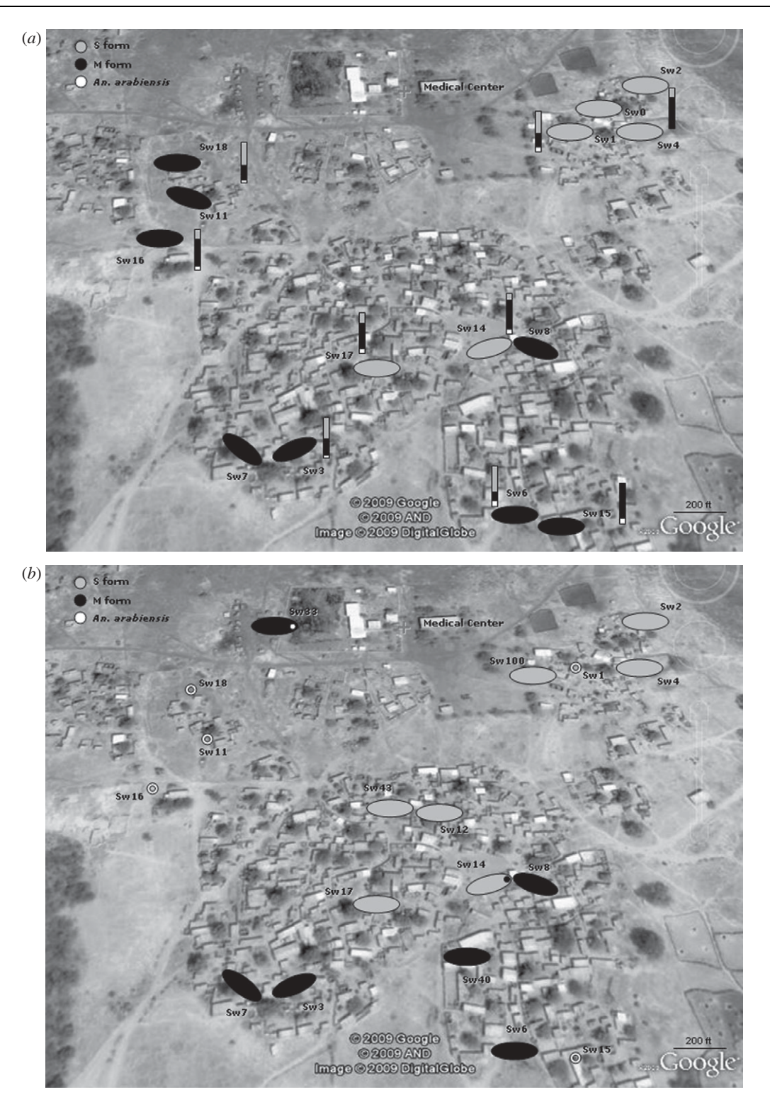
Figure 1. (a) Spatial segregation of swarms of the molecular forms (shaded ovals) and indoor composition of the molecular forms collected in the vicinity of the swarms (vertical bars) in 2006. With the exceptions of swarms 0, 11, 16 and 18, all swarms were sampled more than once (2-8 evenings) at the same site. Swarm sizes ranged from 5 to 74. (b) Spatial segregation of swarms of the molecular forms (shaded ovals) in 2007. Locations of swarms 1, 11, 15, 16 and 18 are seen on the map, but these swarms were not sampled in 2007. Swarm 33 and swarm 14 are mixed swarms respectively of the M form and An. arabiensis, and of the S and M forms.

collected over bare ground, whereas the M form was strongly associated with markers consisting of contrasting dark/light pattern, such as the intersection of vegetation (dark) and footpath (light), a water well (dark) surrounded by bare ground (light), and a physical object such as a donkey cart, a chicken house, or a wall on a lighter background (figure 3). Although one M