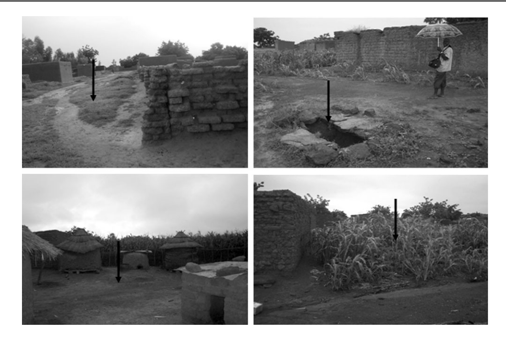
Figure 2. Pictures of representative swarm markers. The arrow indicates the exact placement of the swarm in each site.