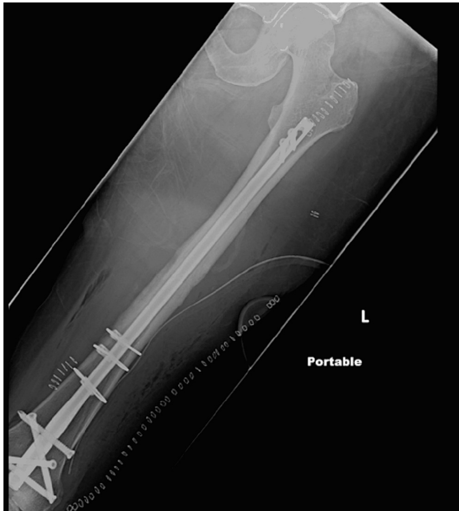
FIGURE 3: Postoperative open reduction and internal fixation (ORIF) x-ray showing good fixation