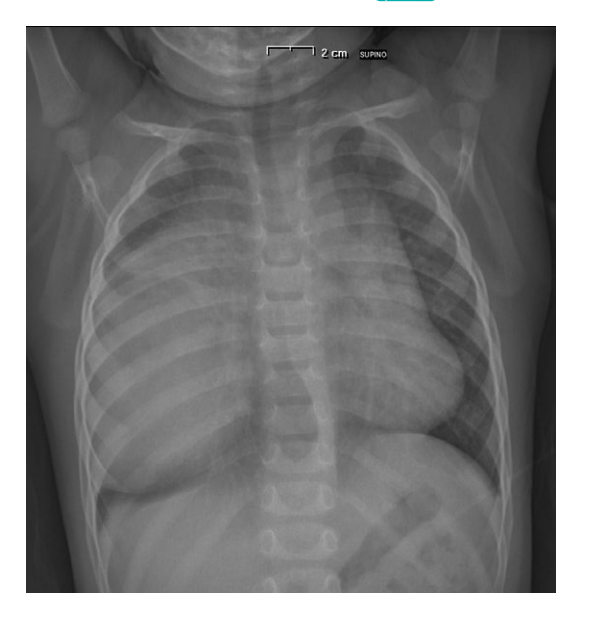
FIGURE 1 Chest X-ray of the infant at presentation, showing a large intrathoracic radiopaque mass occupying the right hemithorax