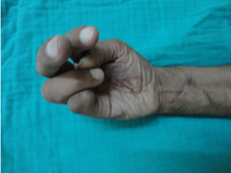
Figure 5: Restoration of finger flexion