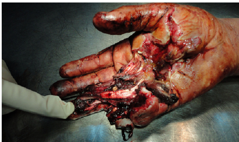
Figure 1: Deep, defiled and circumferential wound interesting Zone III and the ulnar border of the right hand associated to an open distal interphalangeal joint dislocation of the 5th finger