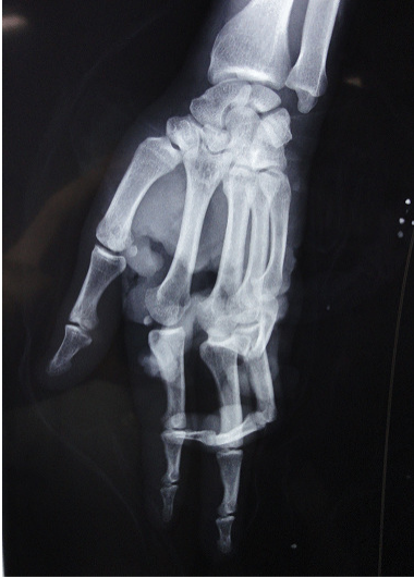
Figure 2: Radiograph of the right hand showing distal interphalangeal joint dislocation of the 5th finger