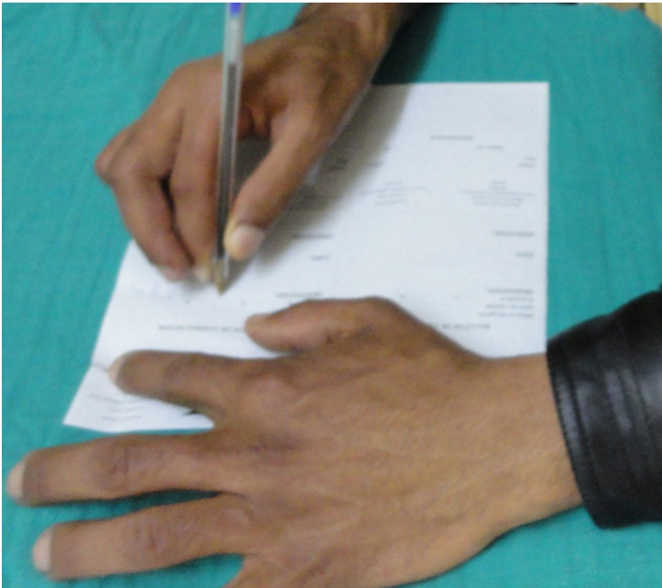
Figure 6: Restoration of functional right hand