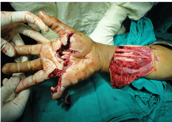
Figure 4: Flexor tendons repair with modified Kessler sutures in musculo-tendinous junction