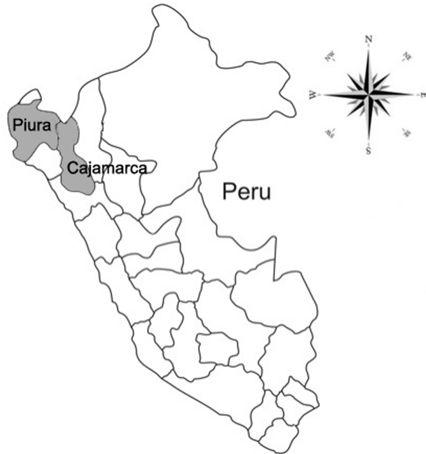
Figure 1. Map of Peru Showing Piura and Cajamarca.