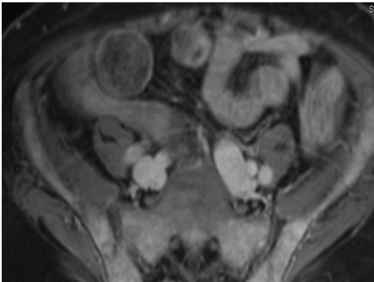
Figure 1 MRI pelvis. Diffuse bone marrow replacement throughout the pelvis and proximal femora with only small areas of residual fatty marrow in the greater trochanters and femoral heads bilaterally. The diffuse enhancement is consistent with extensive disease.

plaints of fatigue and lower extremity edema. On examination, he was afebrile with a heart rate of 75 beats/minute and a blood pressure of 127/70 mmHg. His oxygen saturation was 97% on room air. He had faint crackles at the bases of his lungs bilaterally. His cardiovascular exam was remarkable for 10 cm of jugular venous distension, a regular rhythm, and a 2/6 systolic flow murmur at the left upper sternal border. His abdominal examination was benign. His extremities were warm to touch with 2+ bilateral lower extremity edema. Pertinent laboratory studies were remarkable for a hemoglobin of 9.1 g/dl, a platelet count of 105,000 per microliter, a blood urea nitrogen of 13 mg/dl, a creatinine of 1.0 mg/dl, an albumin of 3.9 g/dl, and a calcium of 9.2 mg/dl. His ECG demonstrated normal sinus rhythm, normal voltage and left atrial enlargement. An echocardiogram with Doppler conveyed hyperdynamic left ventricular function with an ejection