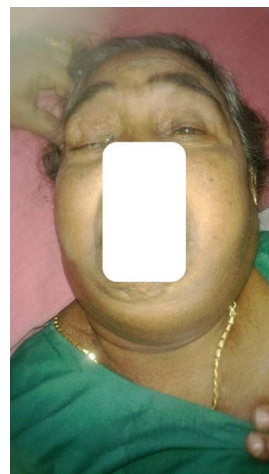
Figure 2. External photograph of the face and upper part of chest showing emphysema involving the right periorbital area, face, and neck.

Subcutaneous emphysema in the head and neck region occurs when air is introduced into the fascial planes of the connective tissue through a site of trauma. [4,5] The trapped air may sometimes extend deep along the facial planes of the neck causing para- and retropharyngeal emphysema with possible extension into the thorax and mediastinum. This complication, although rare, can be life threatening due to close proximity to vital structures in the neck and mediastinum. Orbital and cervicofacial emphysema extending into the mediastinum have been reported following orofacial trauma including fractures, compressed air injuries, and dental procedures involving the use of high speed air-driven hand pieces. [3,5-7] Similarly pneumomediastinum, pneumoperitoneum, and subcutaneous emphysema are known complications following procedures such as upper endoscopy, endoscopic retrograde cholangiopancreatography (ERCP), and colonoscopy, and can occur with or without perforation. [8-10] Pathophysiology of these complications is explained by the anatomical connections between the deep neck fascia, mediastinum, and retroperitoneum, and continuous air insufflations during procedures such as ERCP. When a perforation occurs, free air flows from the duodenum to the retroperitoneal space