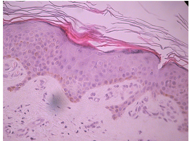
Figure 1B. Hyperorthokeratosis, enlarged keratinocytes without signs of atypical mitoses, increased number of melanocytes (H&E X40).