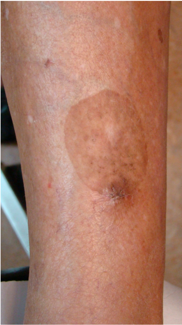
Figure 1A. A sharply demarcated patch on sun exposed skin.