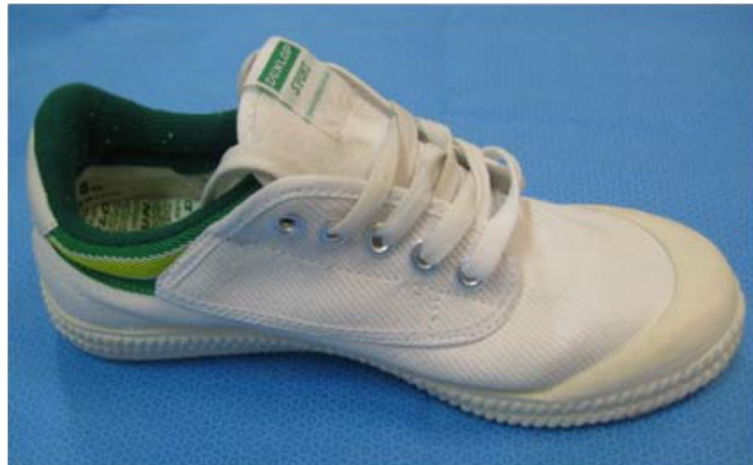
Figure 1 Canvas Dunlop Volley™ (control) shoe.

were considered to have minimal influence on plantar pressures across participants [12]. The participants' own standard footwear (Figure 2) consisted of the shoes the participant wore most regularly and ranged from standard, extra-depth flat lace-up shoes to customised bespoke footwear. The purpose of this footwear condition was to establish pressure offloading properties of standard footwear to enable a direct comparison to the DH Pressure Relief Shoe™. If the participant wore insoles or orthoses that were additional to any insoles that came with the shoe, these were removed prior to measurement.