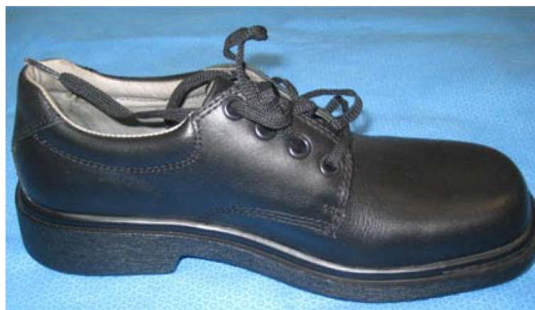
Figure 2 Example of a participant's standard shoe.

To minimise potential ordering effects, the three footwear conditions were tested using a random order sequence,