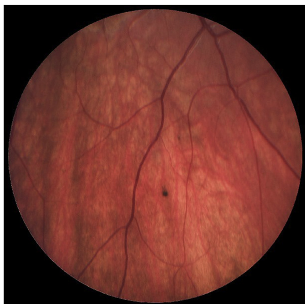
Fig. 4. Left eye, punctate pigmentations.