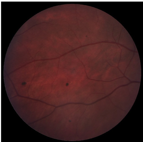
Fig. 2. Right eye, punctate pigmentations.