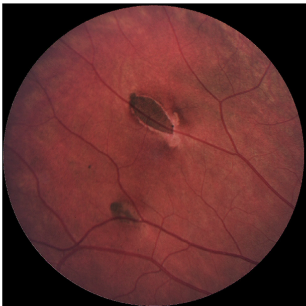
Fig. 1. Right eye, pisiform lesions with halo and small adjunct pigmented spot.