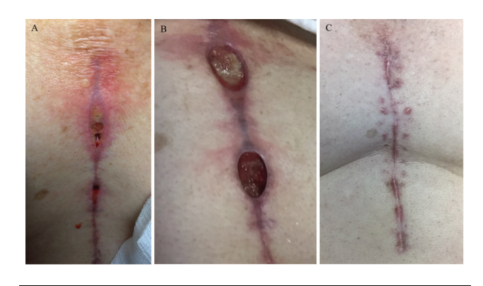
Fig. 1. Images of the coronary artery bypass grafting wound from which G. bronchialis was isolated. (a) 8 weeks post-operative. (b) 12 weeks following initial surgery. 8 cm long sternal incisional wounds with surrounding erythema and clear drainage most prominent at cephalic location. (c) Complete resolution of incision 6 weeks post-debridement.

By disc diffusion testing, our G. bronchialis isolate appeared susceptible to penicillin, gentamicin, levofloxacin, minocycline, vancomycin, linezolid, tetracycline and erythromycin, although there are no established criteria for evaluating zone sizes for this organism. Given previous treatment with vancomycin without improvement, we looked for an alternative drug. Ceftaroline susceptibility was tested by Etest (bioMérieux) and the MIC was 0.19 μg ml<sup>-1</sup>, but there is not a Clinical and Laboratory Standards Institute (CLSI) breakpoint interpretation for this organism. We decided to