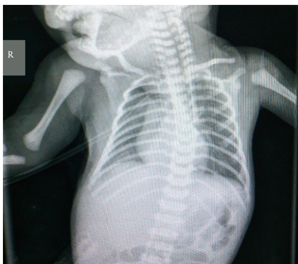
Figure 2. Decreasing the Plural Effusion