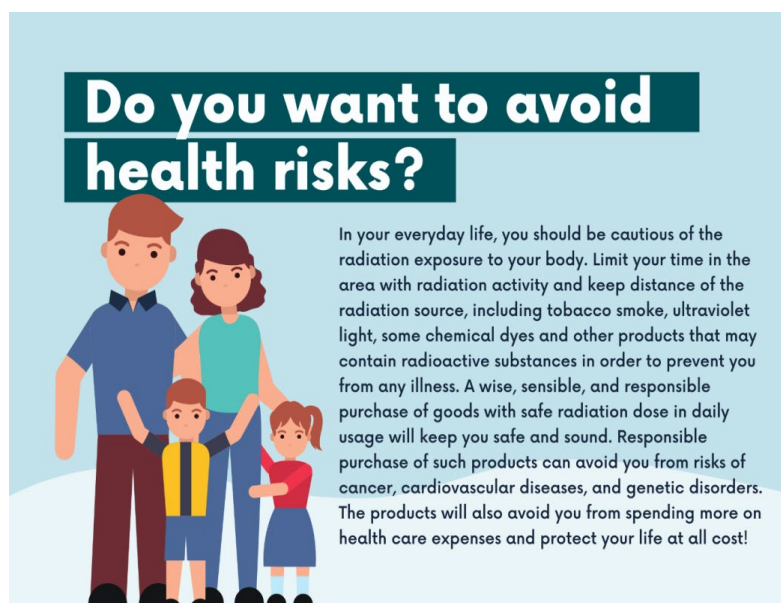
Figure 2. Promotion-Focused Advertisement Stimulus.

Figure 2 illustrates the manipulation of regulatory-focus messaging for promotion-focused advertisement on achieving a healthy life, whereas Figure 3 illustrates the prevention-focused advertising message on avoiding health risks. Both of these regulatory-focus manipulations are set as generic advertisement stimuli for the study.