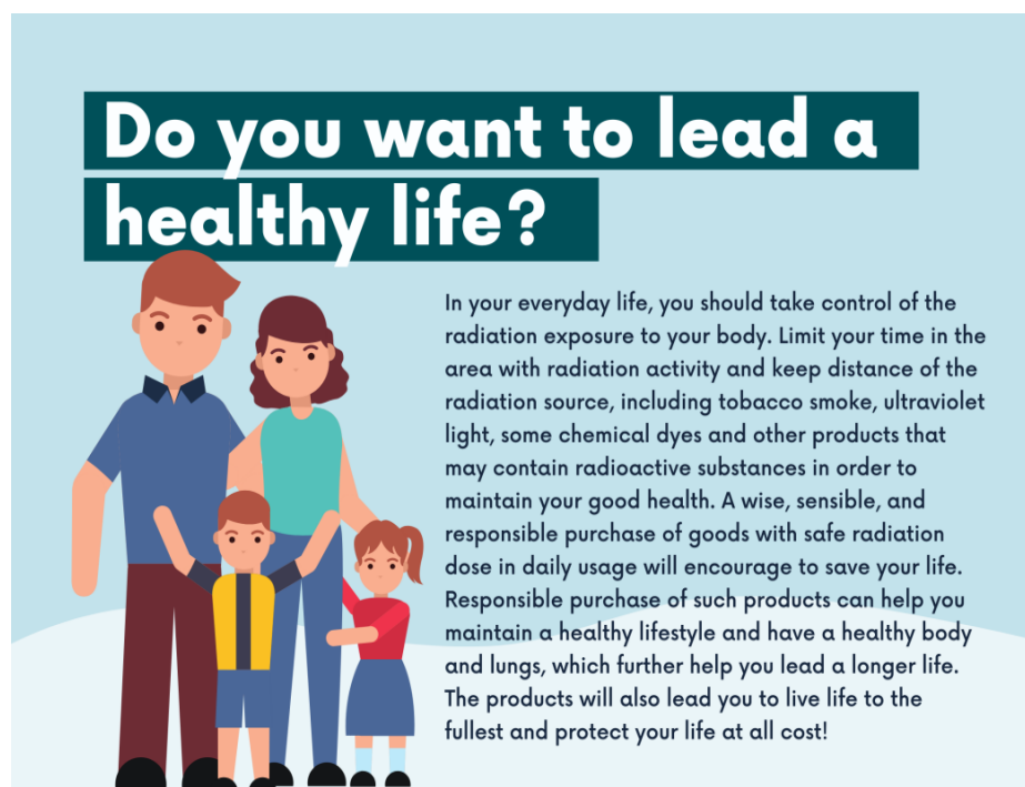
Figure 3. Prevention-Focused Advertisement Stimulus.