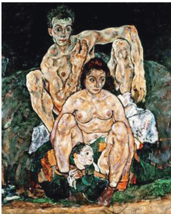
Fig. 1 The Family , Egon Schiele (1918), National Gallery, London.

which target and interrupt multiple, different steps in the influenza virus replication cycle. 5 At this stage infection may be prevented by such innate immune responses, or become established, leading to viral replication. Infection may also be prevented by pre-existing antibodies, particularly those at the respiratory site of viral entry such as IgA.