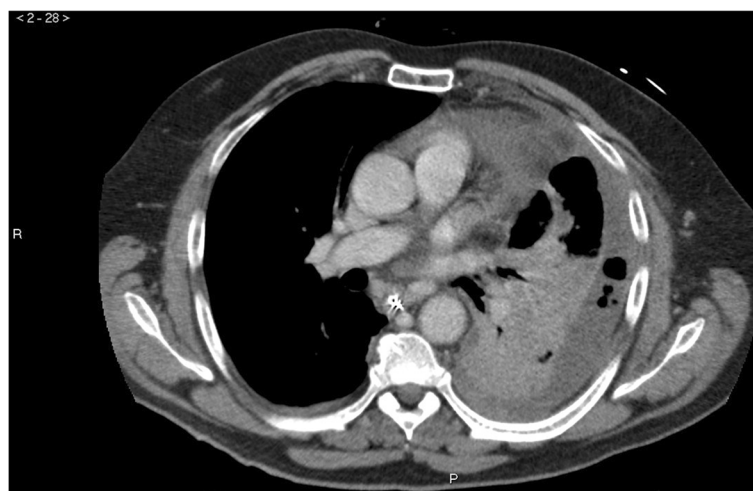
Figure 2 Complications of the oesophageal rupture. Mediastinitis (induration of the mediastinal fat) and extensive left-sided pleural effusion with air pockets.

Further radiological studies should be performed in any patient with a suspicion of Boerhaave's syndrome. Plain chest X-ray is in over 90% of the cases abnormal, with most often mediastinal or free peritoneal air as the initial manifestation [5]. Less often, with cervical oesophageal perforations, prevertebral or subcutaneous air may be present. Despite the high prevalence of plain chest X-ray abnormalities, contrast enhanced CT scan of the chest and upper