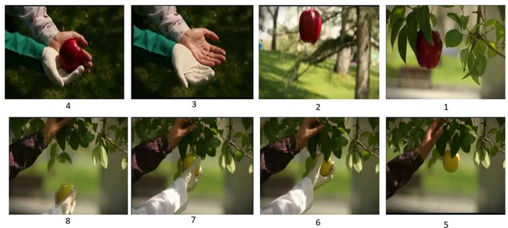
Fig 1. Pictures of the campaign.

maternity care; source of information such as books, newspapers, radio, television, web and obstetricians/midwives/others); assessment of knowledge about the benefits of vaginal birth and the risks of caesarean section (8 items), attitudes toward vaginal birth (10 items) and attitudes toward caesarean section (6 items). Intention for mode of delivery was examined by a 'yes/no' format question. A panel of ten experts (three health education experts, six reproductive health experts and one epidemiologist) approved the final draft of the questionnaire. We used their comments to revise and modify the questionnaire. The expert panel was also used to make judgments about interpretation of the scores. The scoring procedure is described in Box 2.